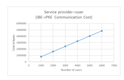
Fig. 5: Service provider \rightarrow User